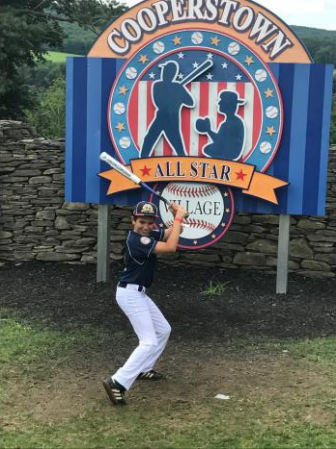
2018 Koa Baseball Teams - Scholarship Fundraising Competition